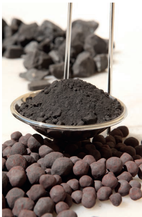
Iron concentrate, iron ore pellets and iron ore